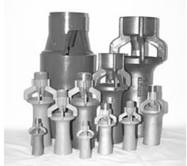
Nozzle and Circulated Flow (usgpm) for ME Series Liqui-Jet Tank Mixing Eductors using 70 deg. F Water

ELMRIDGE 'ME Series' Liqui-Jet Mixing Eductors vigorously and efficiently circulate the liquid contents of tanks without powered impellers or other insertion-type rotating mechanical devices. ELMRIDGE 'ME Series' Liqui-Jet Mixing Eductors operate on the same principle as our standard line of liquid-powered Jet-Apparatus. Liquid is pumped through the Eductor nozzle, emerging at a relatively high velocity, creating a localized zone of lower pressure. Tank contents are drawn to this lower pressure zone, where the momentum of the motive liquid is transferred to the tank liquid, causing the tank liquid to be 'pumped' and circulated. For every gallon of liquid pumped through the Eductor nozzle, up to five gallons of liquid is circulated. Note that Eductors can actually be 'aimed' at specific areas in the vessel. Operating characteristics (Water Motive / Water Suction), for standard models are shown below, and special units are also available to meet your specifications. Standard materials of construction are Glass Reinforced Polypropylene, PVDF, PVC, CPVC, Teflon®, Cast Iron, 316 Stainless Steel, Alloy 20, and Hastelloy C®. Other materials are available upon request. Threaded, flanged, or socket weld connections (except Cast Iron).